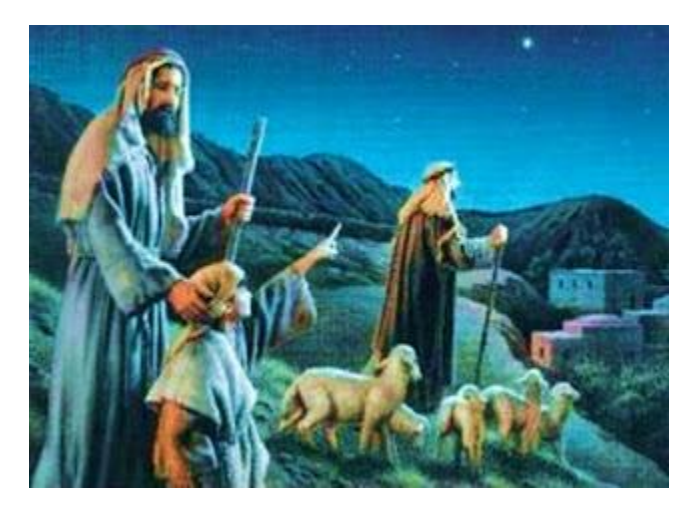
Fig. 5. Art – Shepherds attending their flock see the Star of Bethlehem.

'Yes. Saw them! I wonder if they're a sign like the stars mentioned in our scriptures. There are prophecies about stars appearing at such an event."