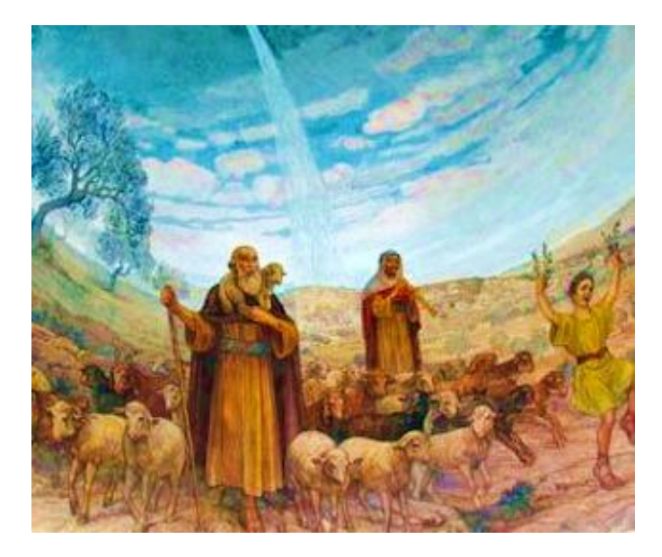
Fig. 4. Art - Shepherds rejoice after appearance of the Angels.

Joab continues, "My Dad handled the situation very bravely and knelt before the Angels. Then we all did the same and listened carefully. Afterwards, there were many more of them appearing and I heard them repeating,