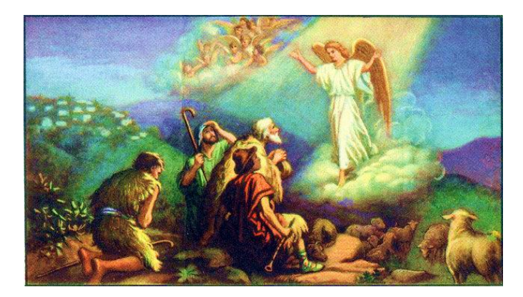
Fig. 2. Art – Angels appear to Shepherds in the Shepherds Field.

We immediately came to Bethlehem to see what has happened, as the Lord told us. Now we have found him just as the Angel said."