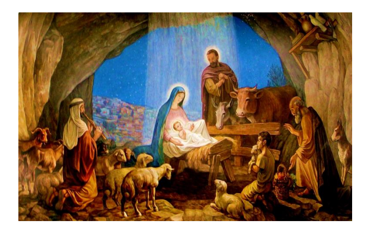
Fig. 6. Art – Shepherds bow to Jesus with Mary and Joseph at the Nativity. One plays music, others bring sheep to the stable cave.

The shepherds slowly return to their flocks which their families are grazing and protecting in the Shepherds Field.